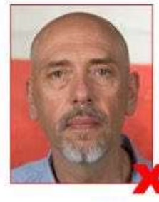
Background not plain