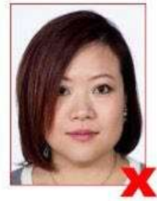
Hair obscuring face