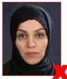
Background too dark