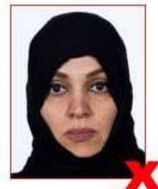
Eyes/edges of face obscured