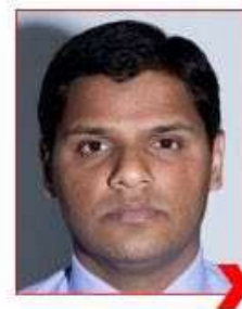
Shadows on image and background