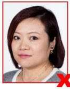
Side on to camera