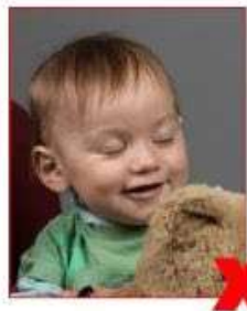
Eyes not open/toy visible